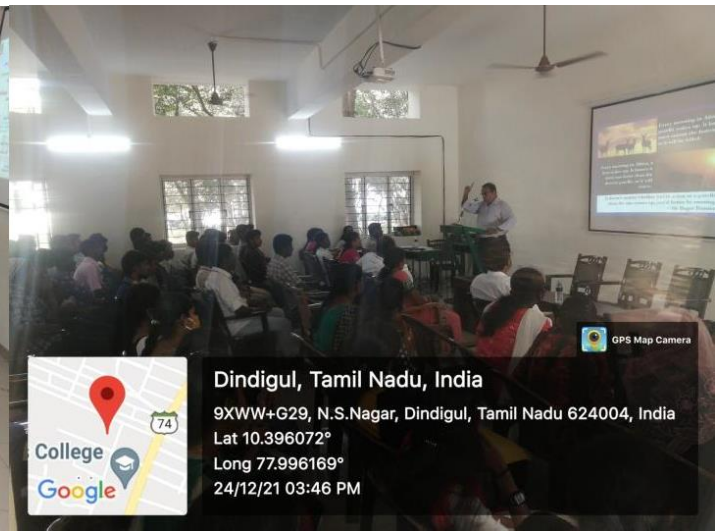
Vote of Thanks