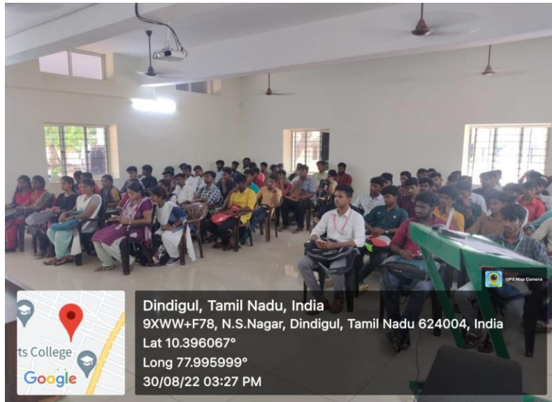
Concept of Entrepreneurship