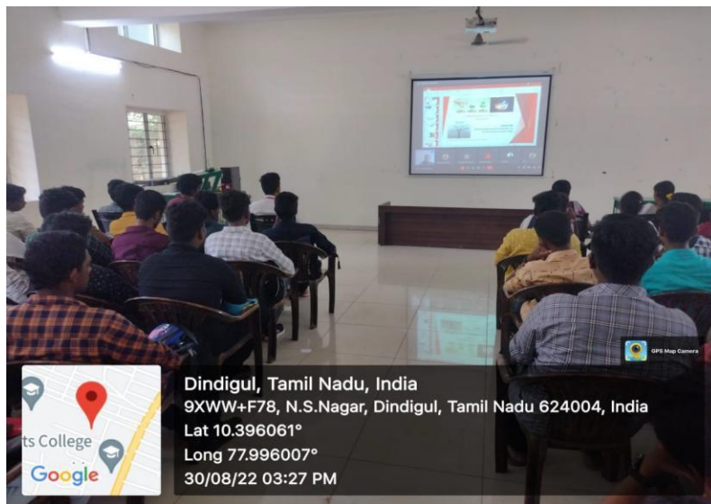
Procedures of the new Business explained with examples